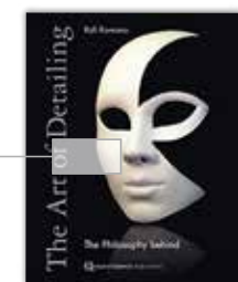
Rafi Romano 360 Pages | 1,158 Illustrations