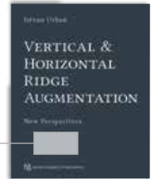
Istvan Urban 400 pages | 1,229 Illustrations

► The path to exceptional clinical results and patient satisfaction begins with a solid philosophical foundation. This multicontributed book brings together representative cases from respected clinicians around the world to illustrate the philosophies that must guide sound treatment decisions. The book is organized by the broad topics of careful patient evaluation and diagnosis, interdisciplinary treatment planning, and minimally invasive and patient-centered treatment, with each chapter presenting the specific philosophy underlying one or more cases treated by the author. For each case, the author shares special challenges that were faced and a retrospective evaluation that highlights aspects of treatment that could be improved given new knowledge and insight. The clinical cases are presented with full-color images showing treatment from planning to result with accompanying text that details nuances of the case that bring it into full clinical focus. An elegant and thoughtful volume sure to fascinate and inspire the reader.