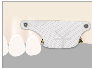
New “T 2 ” membranes provide buccal fixation points outside of the defect area.